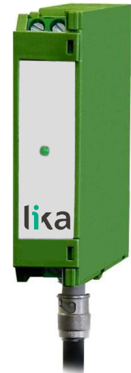
IF60 - IF61