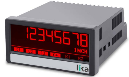
LD350 • LD355