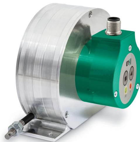
SFAM1 TA • SFAM2 TA