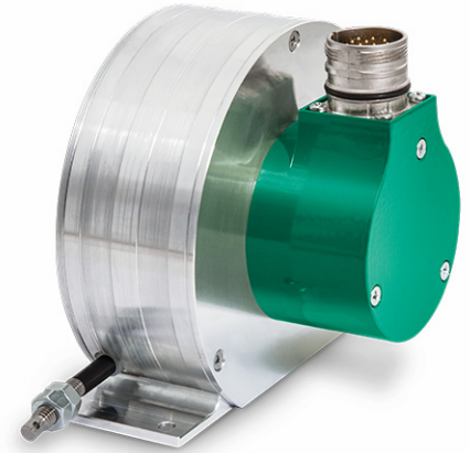
SFEM1 • SFEM2