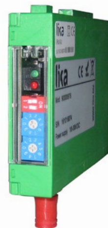
IF62 - IF63